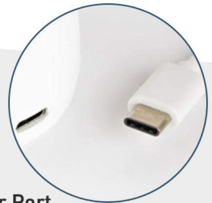
USB-C Power Port

4 Hours Fast Charge Can be Plugged in Reverse