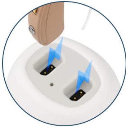
Magnetic Charging Dock