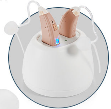
Can be Installed in Reverse