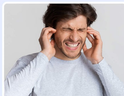
Mode 3 Tinnitus Masking Mode

Note: In tinnitus masking mode, the device will produce white noise to cover the tinnitus and help relieve the discomfort.