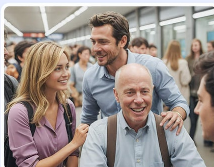
Mode 2 Noisy Environment Mode